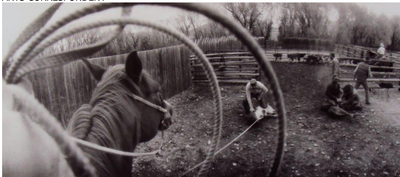
Orah Moore: "Through the Ropes"

Ranchers toss hay to cattle from the back of pickup trucks, corral and brand calves, round up their herds as snow blankets the ground. They go to the local parade and horse sales and occasionally find a few minutes' leisure sitting on a porch or fence. The ranchers in Orah Moore's photographs "Stewards of the Land" work hard and live in the vast landscape of the American west.