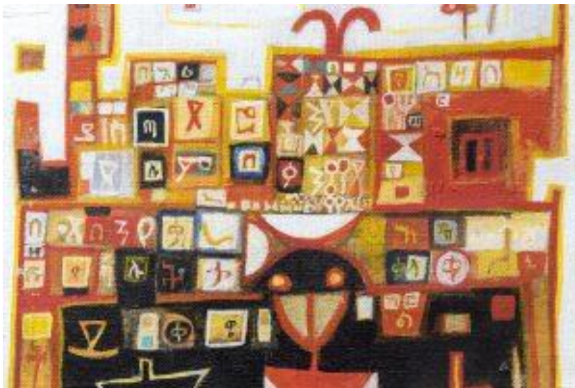
Wosene: "Magic Scroll" (detail) (1987), acrylic on linen.

There's a rich, thought provoking variety in the exhibition, with the artists' use of text, letters and symbols, starting with Joe Cariati's "Surface Study Letter A" at the entrance and continuing to the Towers of Babel.