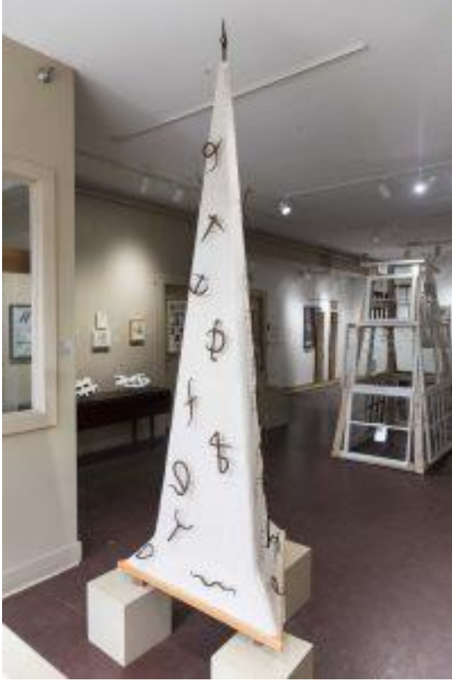
James Teuscher: "Tower of Babel" 2018, steel, plaster.

The two distinctive towers stand in SPA's Main Floor Gallery. One is a fragile structure of windows and words, the other a rocket-like tower with iron letters and symbols.